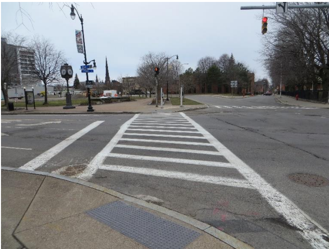
SE Corner Goodell Street at Main Street (Facing West)