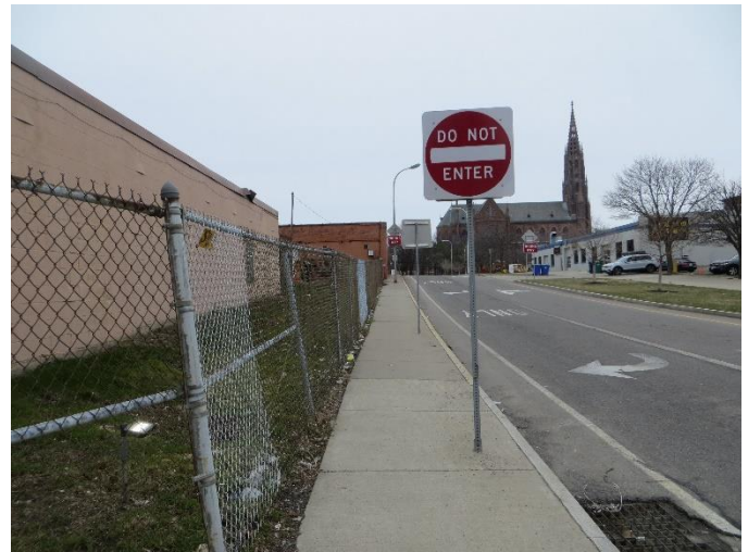
NW Corner Pearl Street at Tupper Street (Facing North)