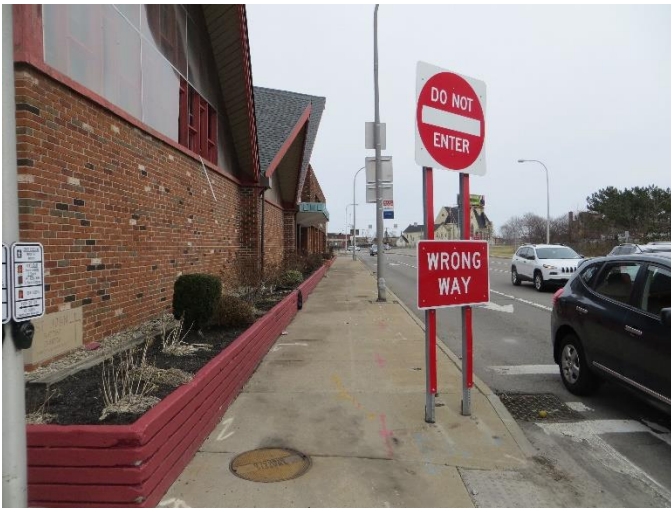
NE Corner of Goodell Street at Michigan Avenue (Facing East)