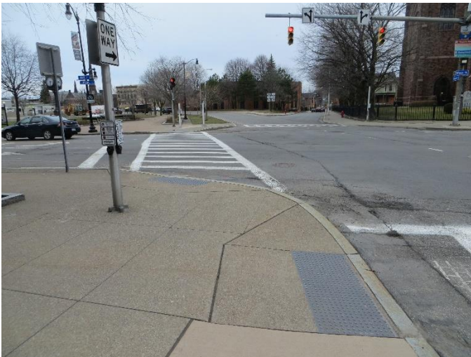
SE Corner Goodell Street at Main Street (Facing West)