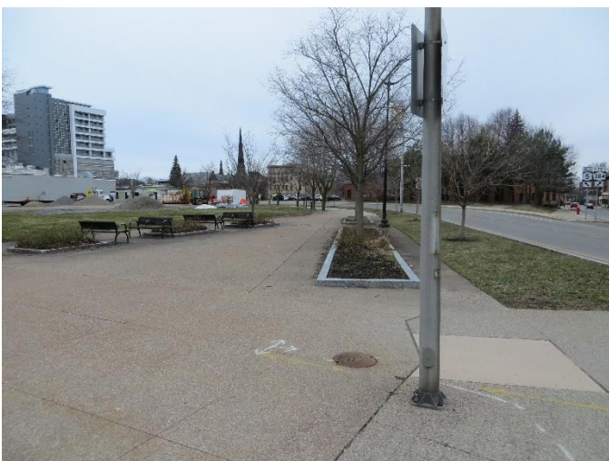
SW Corner Pearl Street at Main Street (Facing West)