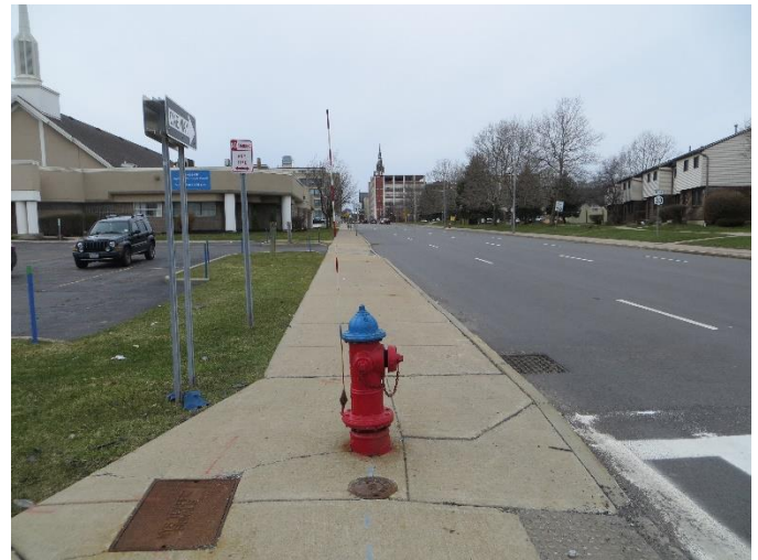
SW Corner of Goodell Street at Michigan Avenue (Facing West)