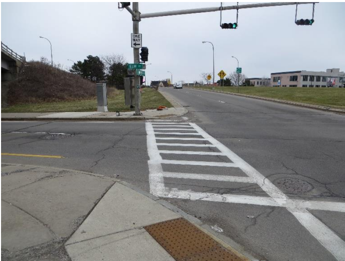
NW Corner Tupper Street at Elm Street (Facing East)