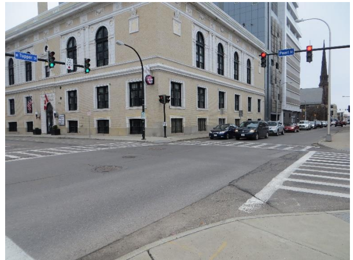
NE Corn Pearl Street at Tupper Street (Facing Southwest)