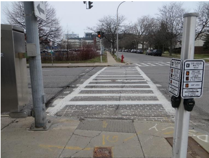
SW Corner of Goodell Street at Oak Street (Facing North)