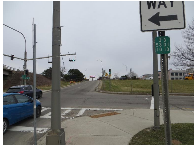
SW Corner Tupper Street at Elm Street (Facing East)