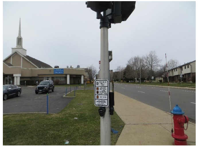
Goodell Street at Michigan Avenue (Facing North)