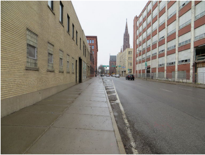
Goodell Street SW sidewalk at Ellicott Street (Facing West)