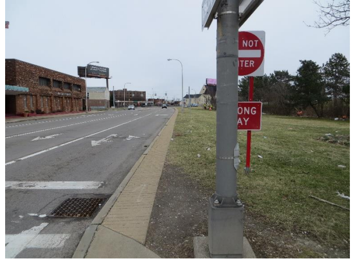
SE Corner of Goodell Street at Michigan Avenue (Facing East)