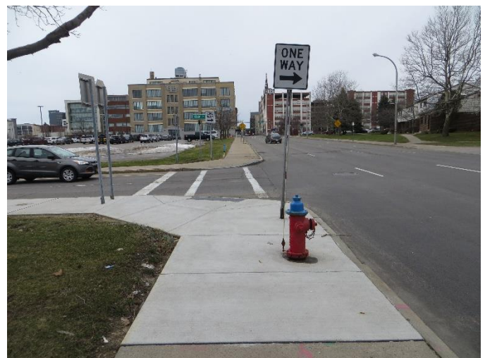
SE Corner of Goodell Street at Elm Street (Facing West)