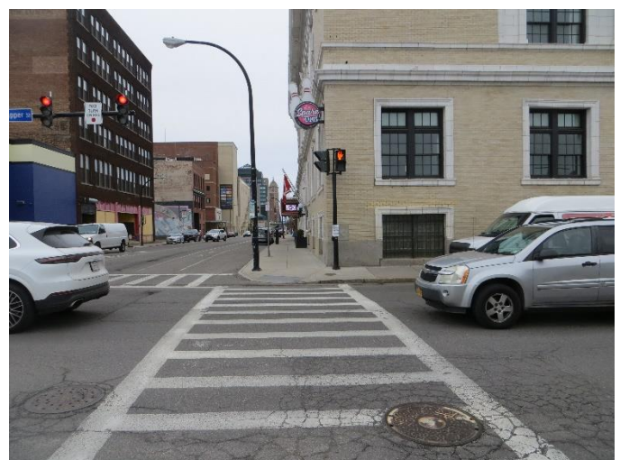
NW Corner Pearl Street at Tupper Street (Facing South)