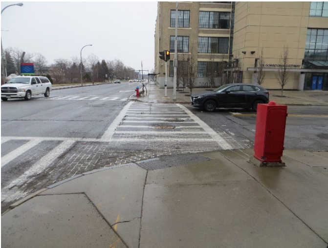
Goodell Street South crosswalk at Ellicott Street (Facing East)