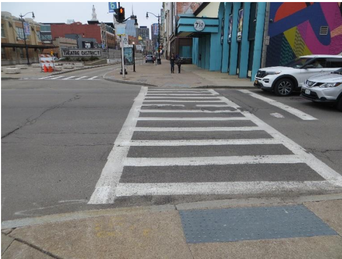
NW Corner Tupper Street at Main Street (Facing South)