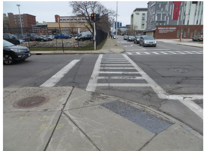
SW Corner Tupper Street at Ellicott Street (Facing North)