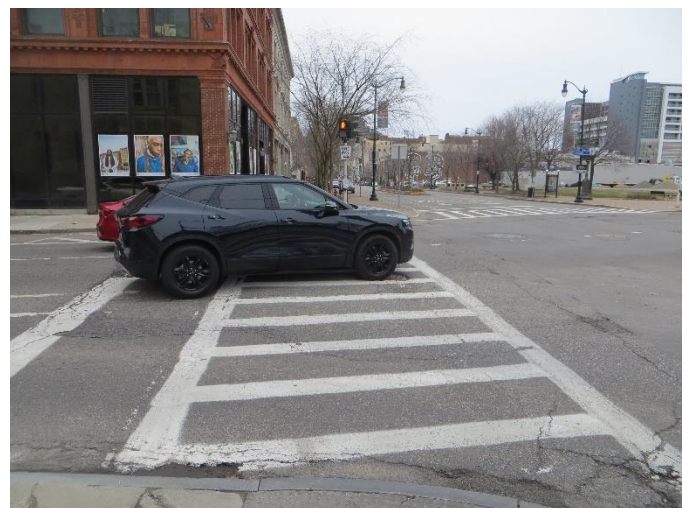
NE Corner Goodell Street at Main Street (Facing Northwest)