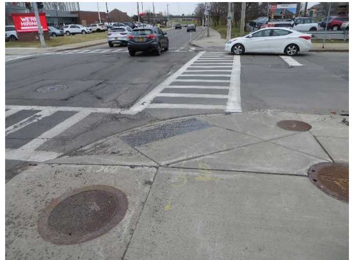
SW Corner Tupper Street at Ellicott Street (Facing East)