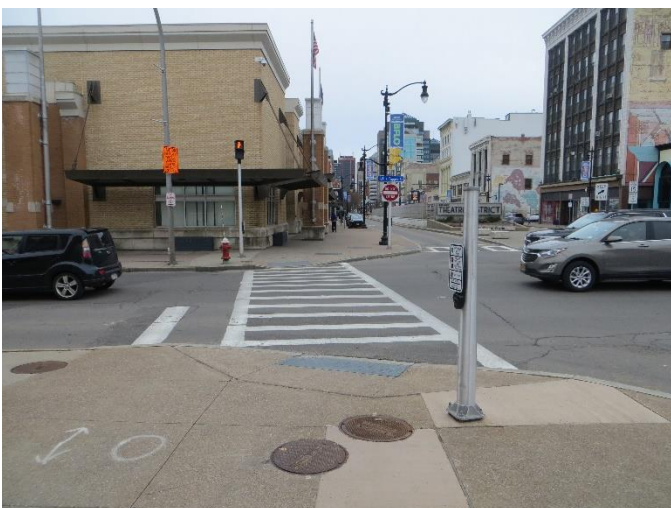
NE Corner Tupper Street at Main Street (Facing South)