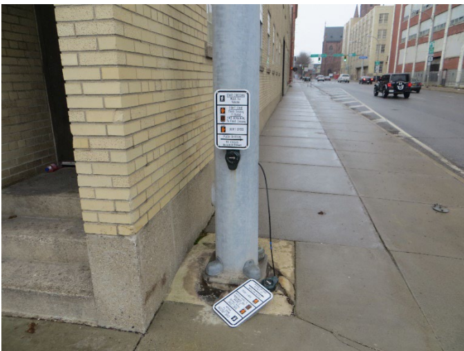
SW Traffic Signal Pole at Goodell Street and Ellicott Street