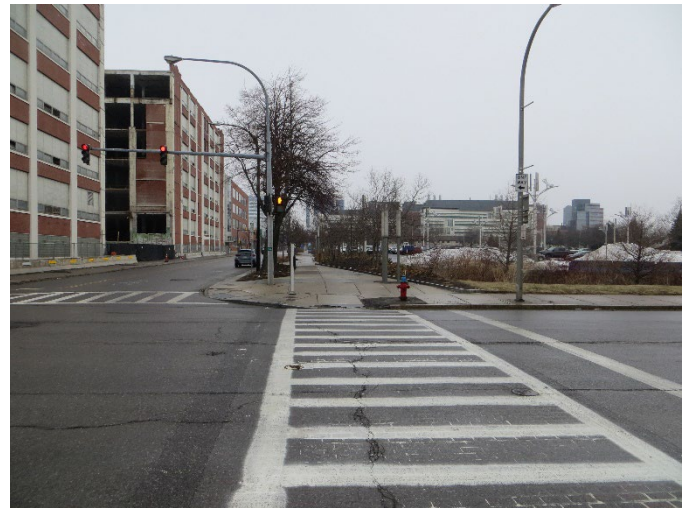
Goodell Street East crosswalk at Ellicott Street (Facing North)