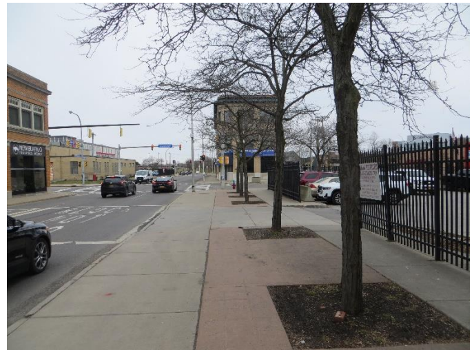
Southside Tupper Street Between Main Street and Washington Street (Facing East)