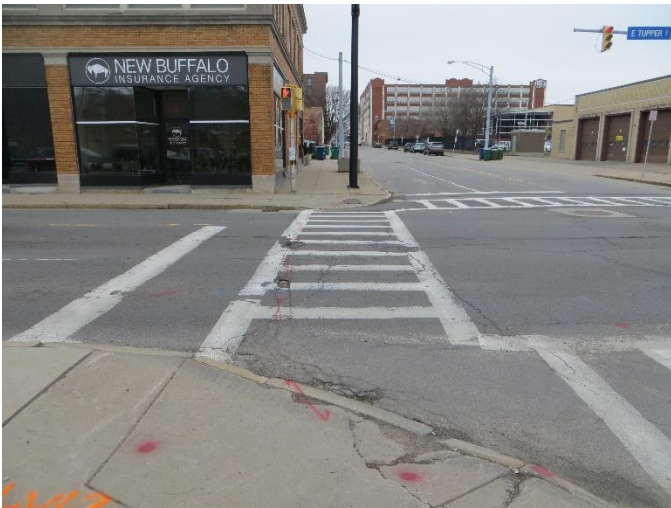
SW Corner Tupper Street at Washington Street (Facing North)