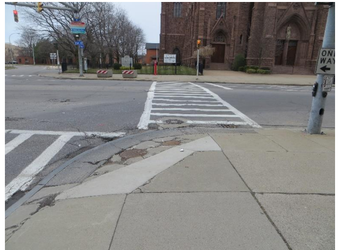
NE Corner of Goodell Street at Main Street (Facing West)