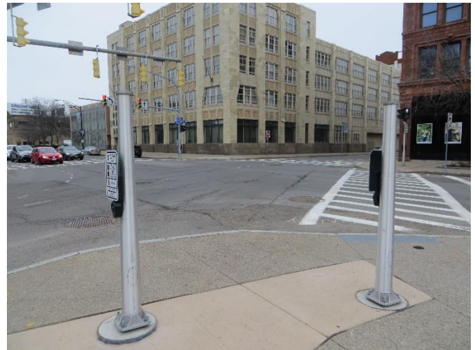
SW Corner Pearl Street at Main Street (Facing Northeast)