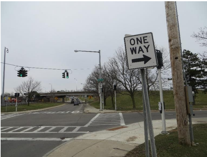
SW Corner Tupper Street at Oak Street (Facing East)