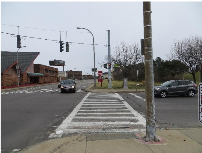
Goodell Street South crosswalk at Michigan Avenue (Facing East)