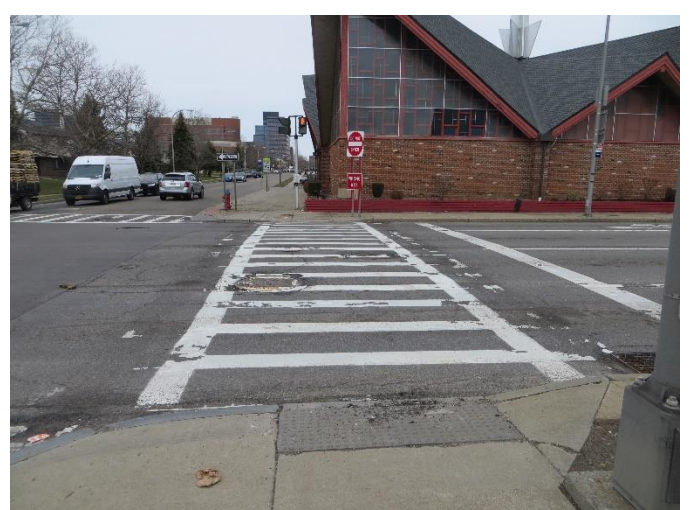
SE Corner of Goodell Street at Michigan Avenue (Facing North)