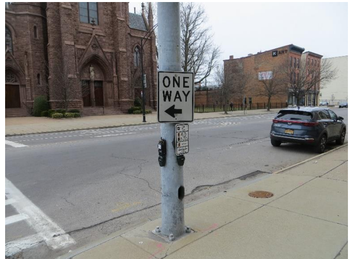
NE Signal Pole at Goodell Street at Main Street (Facing Northwest)