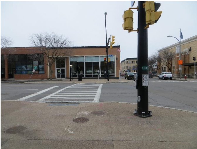
NW Corner Tupper Street at Main Street (Facing East)