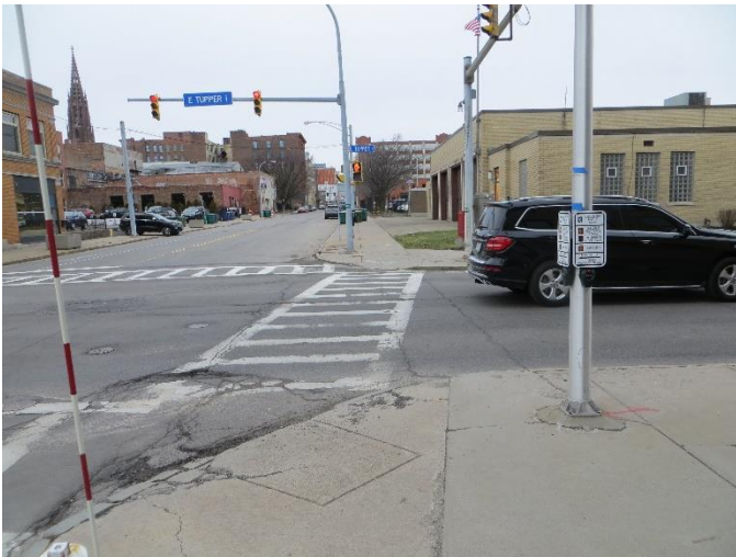
SE Corner Tupper Street at Washington Street (Facing North)