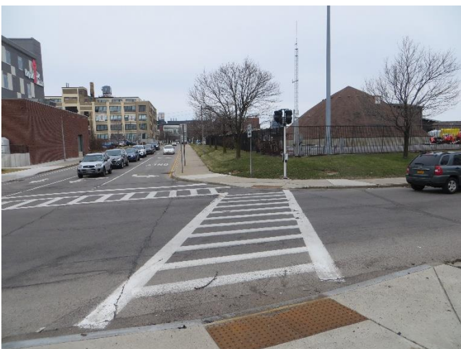
SE Corner Tupper Street at Oak Street (Facing North)