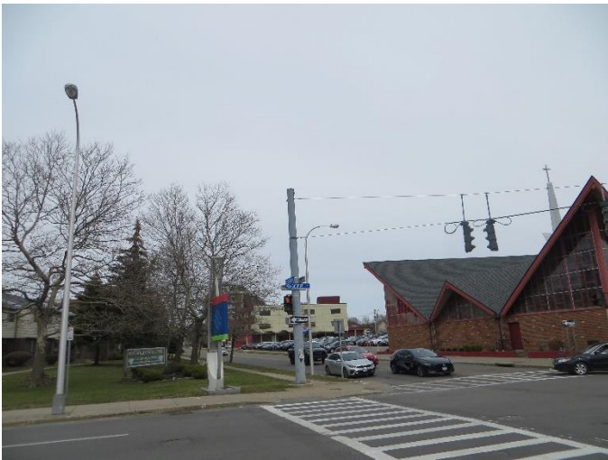
NW Corner of Goodell Street at Michigan Avenue (Facing North)