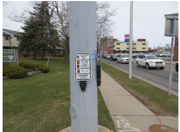
NW Signal pole at Goodell Street at Michigan Avenue (Facing North)