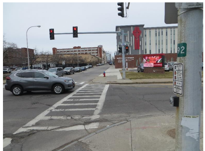
SE Corner Tupper Street at Ellicott Street (Facing North)