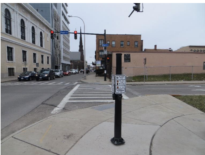
NE Corner Pearl Street at Tupper Street (Facing West)