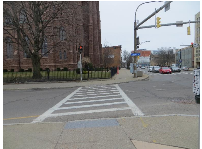
SW Corner Pearl Street at Main Street (Facing North)