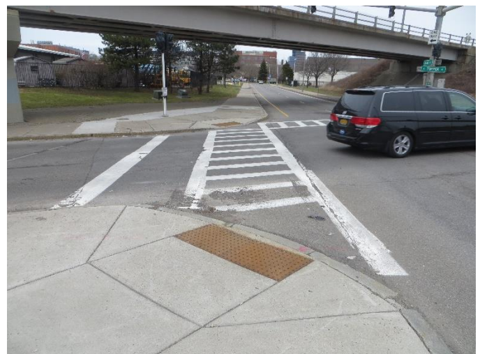
SW Corner Tupper Street at Elm Street (Facing North)