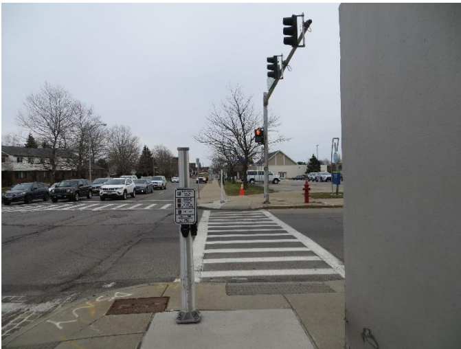
SW Corner of Goodell Street at Oak Street (Facing East)