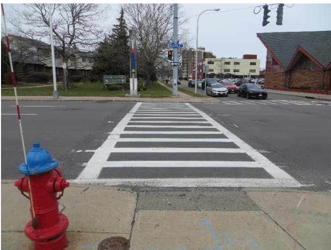
Goodell Street South crosswalk at Michigan Avenue (Facing North)