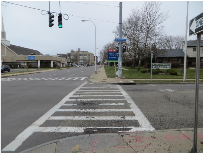
NE Corner of Goodell Street at Michigan Avenue (Facing West)