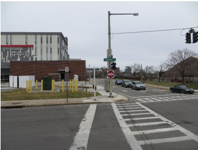
SW Corner Tupper Street at Oak Street (Facing North)