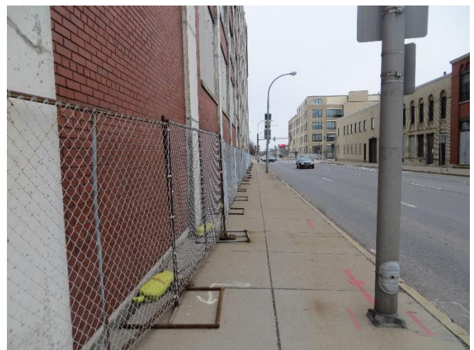
NE Corner of Goodell Street at Washington Street (Facing East)