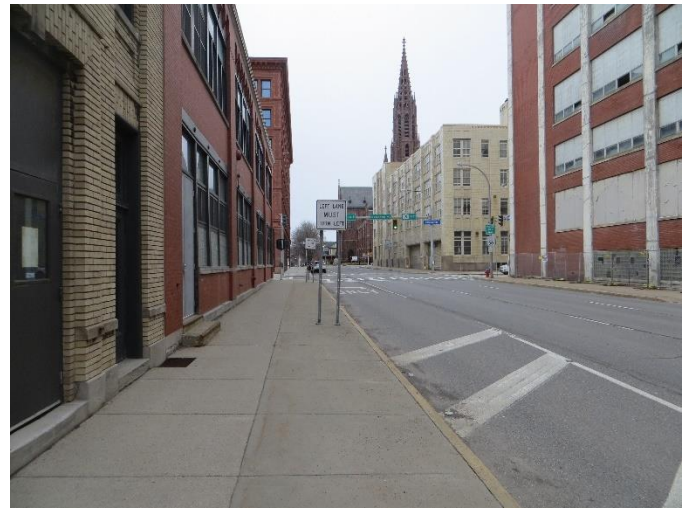
Southside of Goodell Street between Ellicott Street and Washington Street (Facing West)