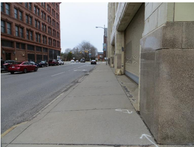
NW Corner of Goodell Street at Washington Street (Facing West)