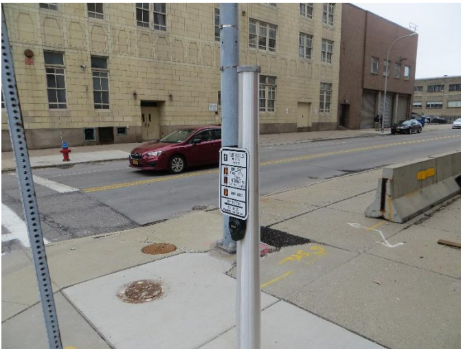
NE Ped Button at Goodell Street at Washington Street (Facing Northwest)