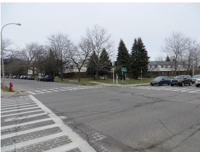
SW Corner of Goodell Street at Oak Street (Facing Northeast)