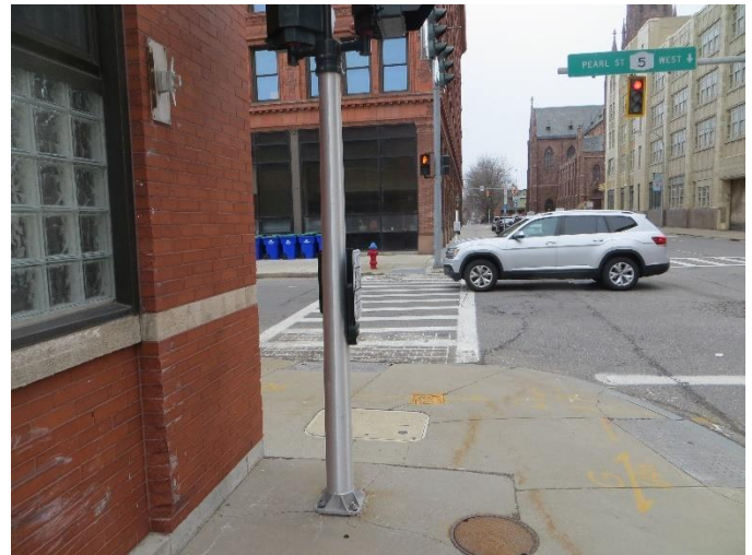
SE Corner of Goodell Street at Washington Street (Facing West)