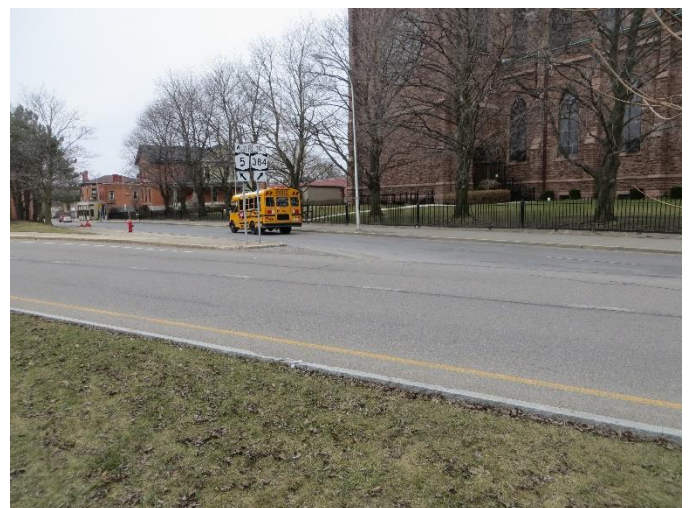
Southside of Pearl Street near Edward Street (Facing Northwest)