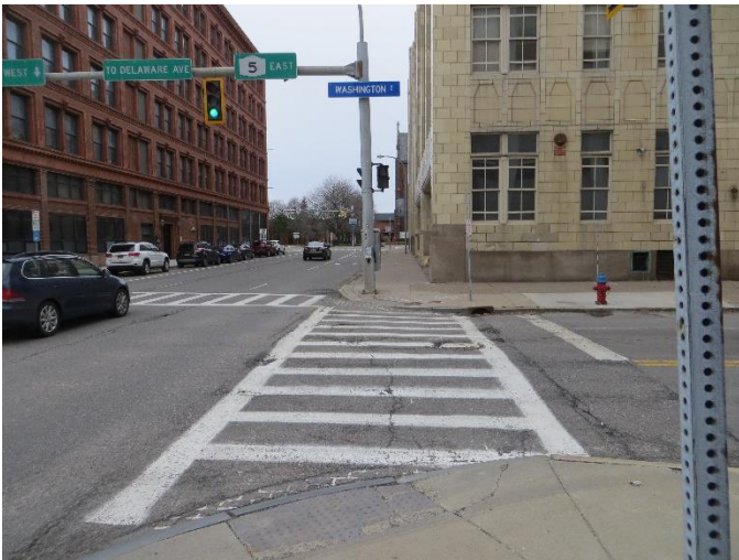
NE Corner of Goodell Street at Washington Street (Facing West)