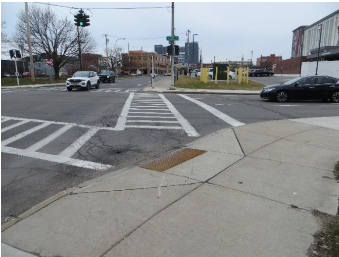
NE Corner Tupper Street at Oak Street (Facing West)