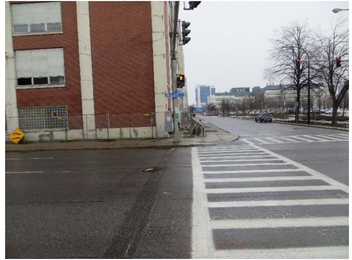
Goodell Street West crosswalk at Ellicott Street (Facing North)