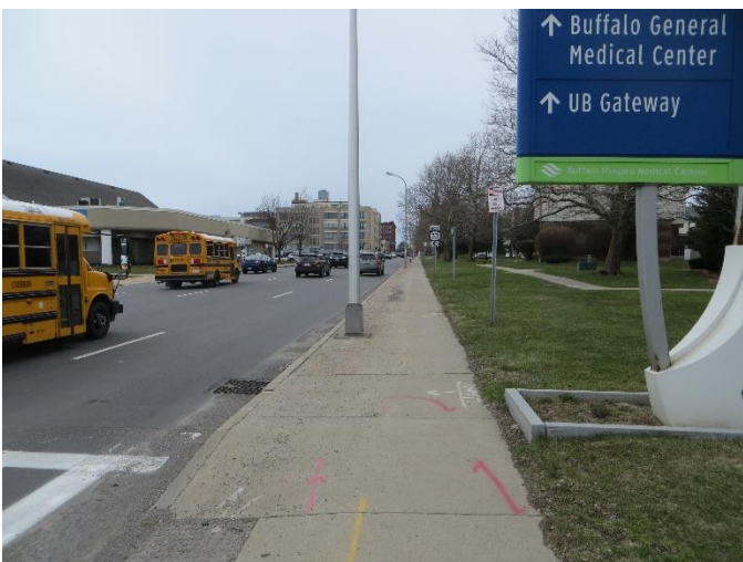
NW Corner of Goodell Street at Michigan Avenue (Facing West)