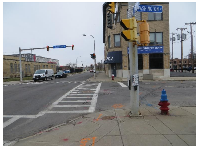
SW Corner Tupper Street at Washington Street (Facing East)