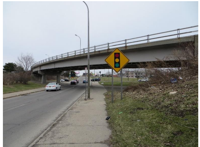
Southside Tupper Street between Oak Street and Elm Street (Facing East)