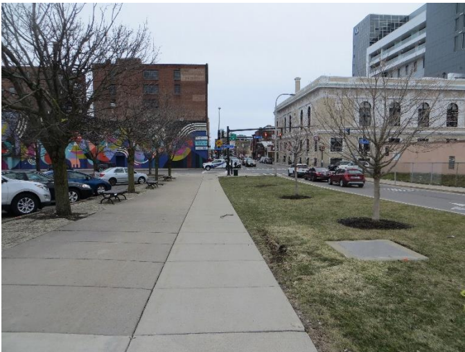
Westside Pearl Street between Edward Street and Tupper Street (Facing South)