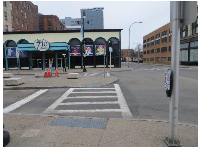
SE Corner Tupper Street at Main Street (Facing West)