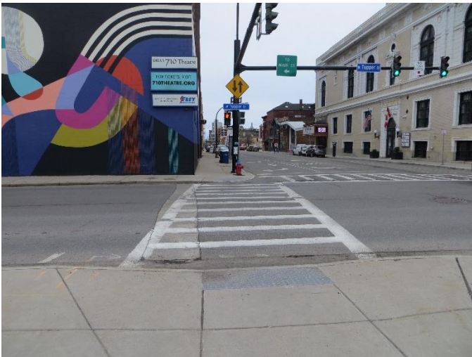
NE Corner of Pearl Street at Tupper Street (Facing South)