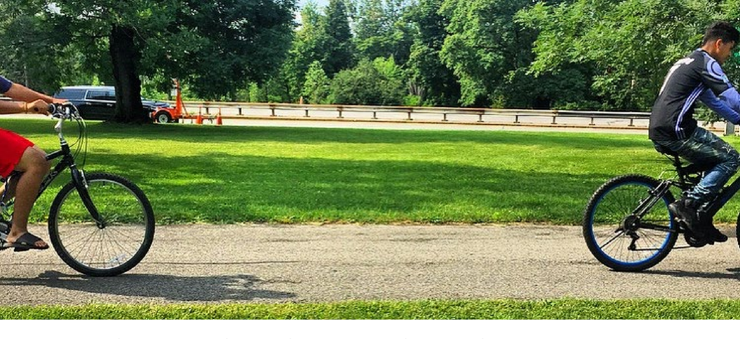
b. Regional Bicycle Master Plan Implementation Proposed Project Intake Approach